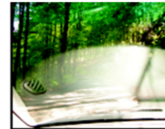
WITHOUT POLARIZED LENSES

There is no other circumstance where glare is more damaging than while driving a car. Besides the traditional sources of glare, drivers must endure glare formed by the dashboard on the windshield. Multiple research data shows that glare can reduce a driver's visual acuity. Polarizing lenses solve this problem.