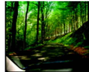
WITH POLARIZED LENSES